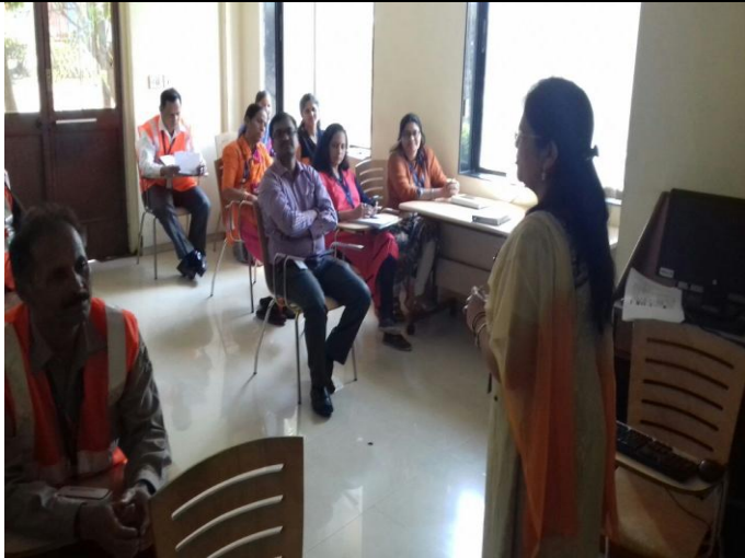
HSE representative sharing awareness campaign