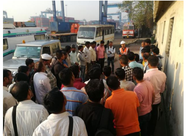
Toolbox talk with ITV drivers