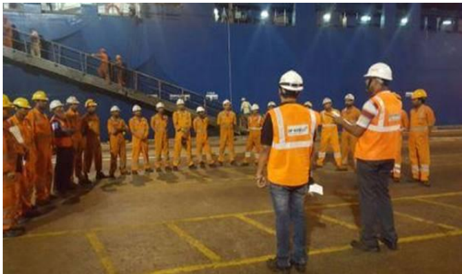
Awareness campaign with checkers and lashers