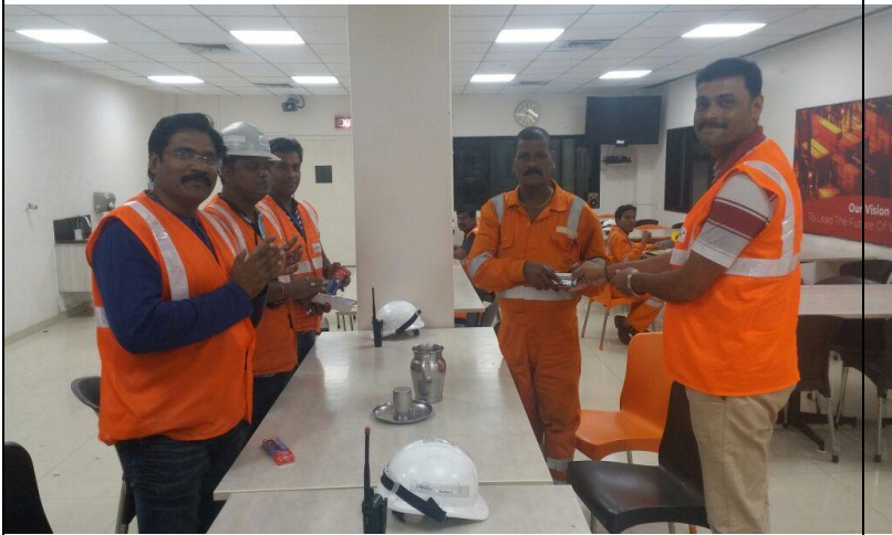
HSE representative presenting Gifts to quiz winners