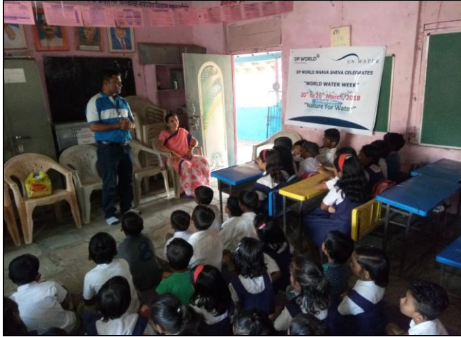
HSE representative sharing knowledge on water conservation