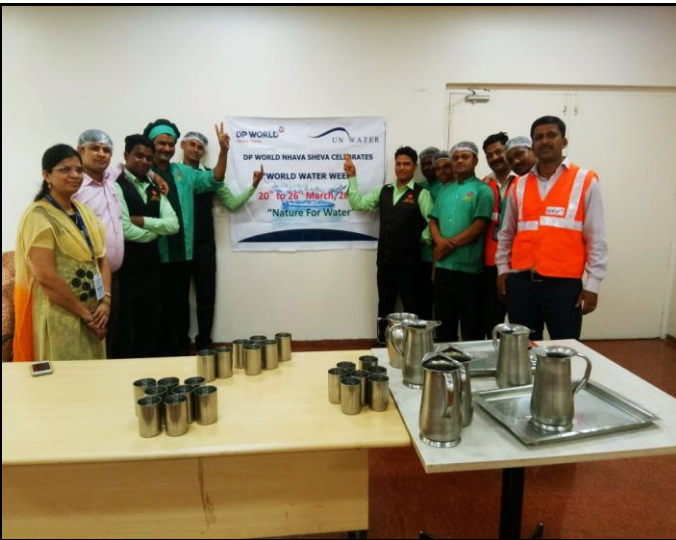
Participants with HSE representatives

In recent years, we have begun using games as a way to provide Employees and contractors opportunities to experience social dilemmas related to the governance of common resources. The games simulate real-life decision making, such as selecting the most efficient water saving techniques. A game is conducted on the concluding day of World water week. Canteen staff is given water to serve in Glasses, they have to minimize the water loss while serving and complete filling glasses in stipulated time. Gifts are distributed to winners. Participants expressed their happiness participating in this program and appreciated HSE team for the initiative.