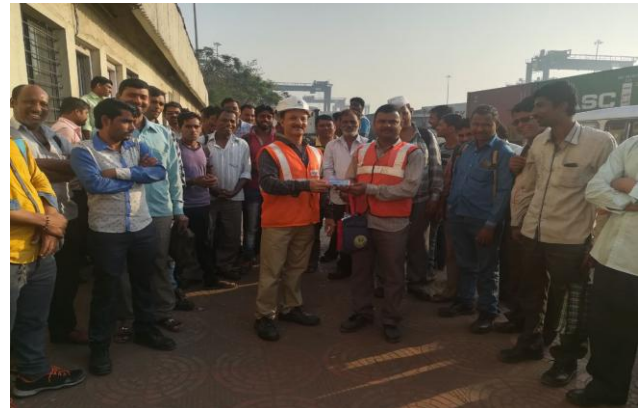
HSE representative giving Gift to ITV drivers who won spot quiz