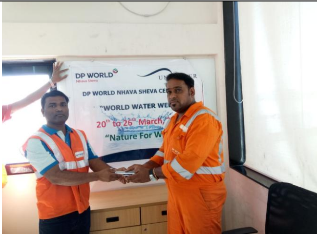
HSE representative presenting Gifts to quiz winners