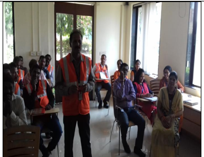
Contracted supervisors delivering speech