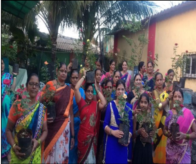
Distributing saplings to participants

of planting trees and How trees can help to conserve water.