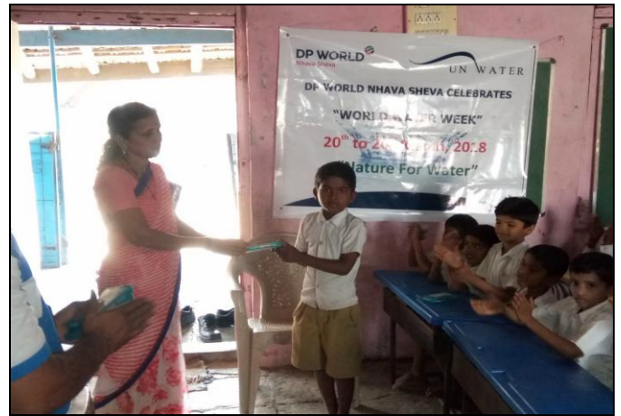
Prize distribution to winners