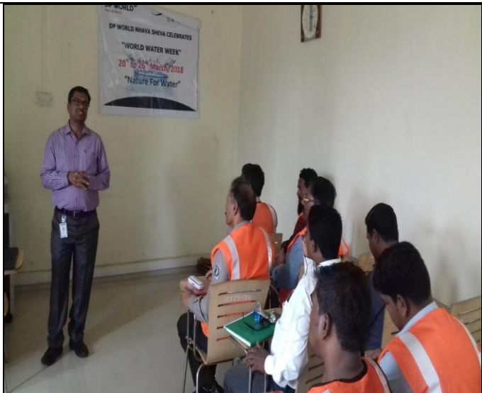
UDR Delivering speech