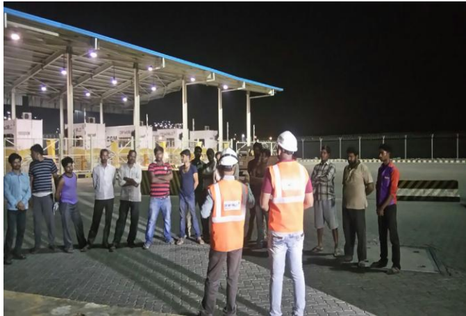
Awareness campaign for Truck drivers