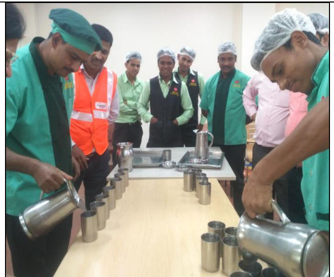
Participants Playing Game