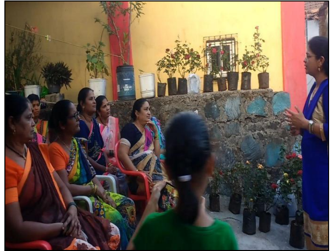
HSE representative sharing knowledge on water conservation