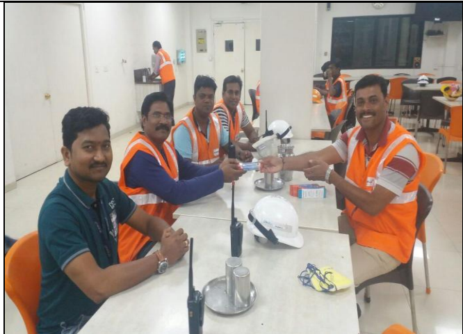
HSE representative presenting Gifts to quiz winners

Team has conducted a survey on water leakages inside the Terminal. Informed and arranged to rectify the leakages on immediate basis