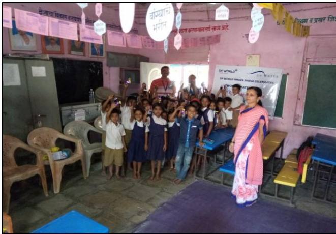
HSE representative with participants