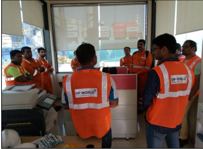
HSE representative addressing the gathering