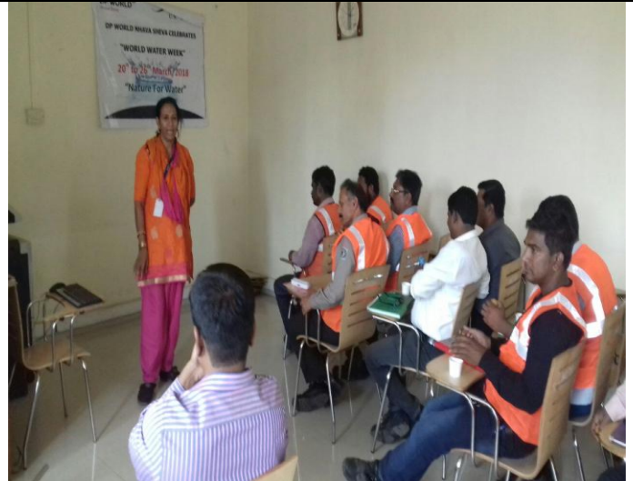
Contracted supervisors delivering speech