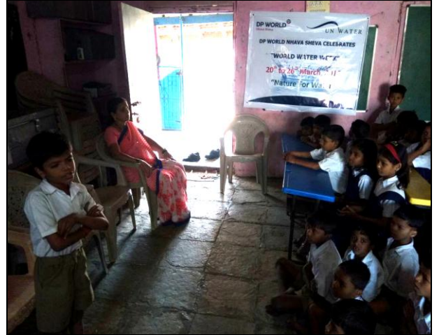
Active participation of students in speech